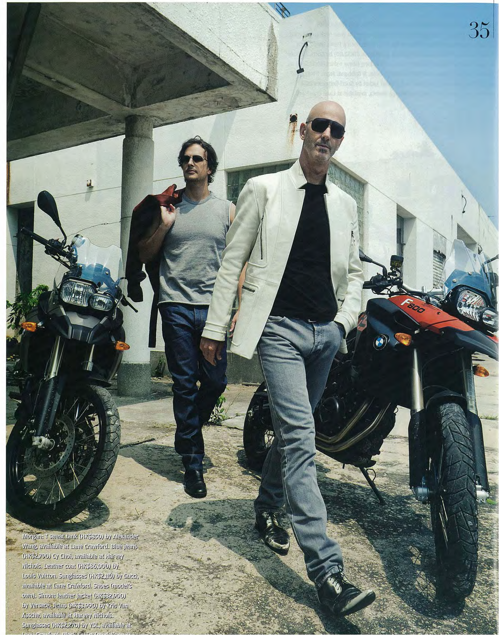
Morgan: T sweat tank (HK$350) by Alexander Wang, available at Lane Crawford. Blue jeans (HK$2,790) by Cy Choi, available at Harvey Nichols. Leather coat (HK$36,000) by Louis Vuitton. Sunglasses (HK$2,110) by Gucci, available at Lane Crawford. Shoes (model's own). Simon: leather jacket (HK$32,900) by Versace. Jeans (HK$3,990) by Kris Van Assche, available at Harvey Nichols. Sunglasses (HK$2,270) by YSL, available at Lane Crawford. Shoes (model's own).